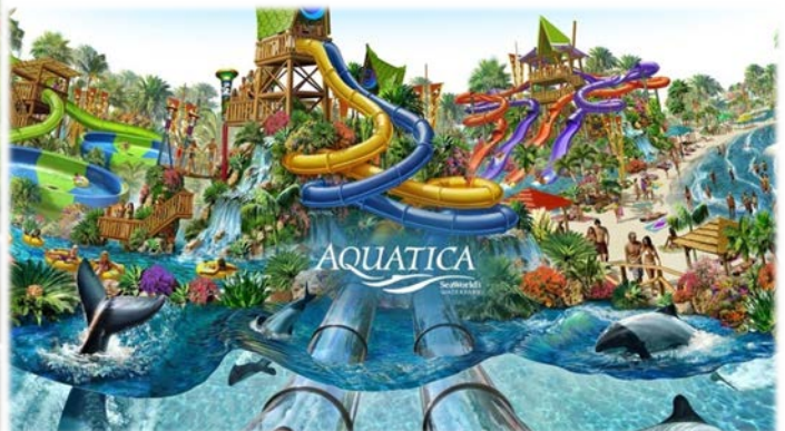
SeaWorld Aquatica – San Antonio, Texas; Orlando, Florida and San Diego, California