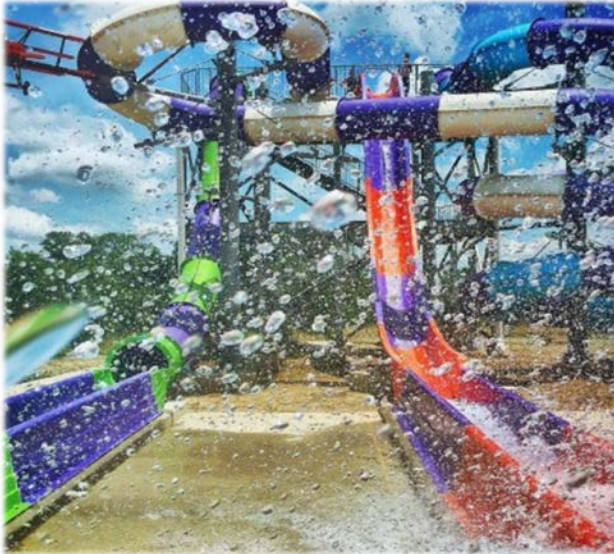
Splash Kingdom Waterparks – Greenville, Canton, Shreveport, Weatherford & Nacogdoches, Texas

More places than you could ever splash in to stay cool; Texas or nationwide!