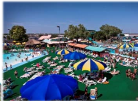
White Water Bay – Oklahoma City, OK – check out "TicketsAtWork" on ticket page of www.e-club.org

More places than you could ever splash in to stay cool; Texas or nationwide!