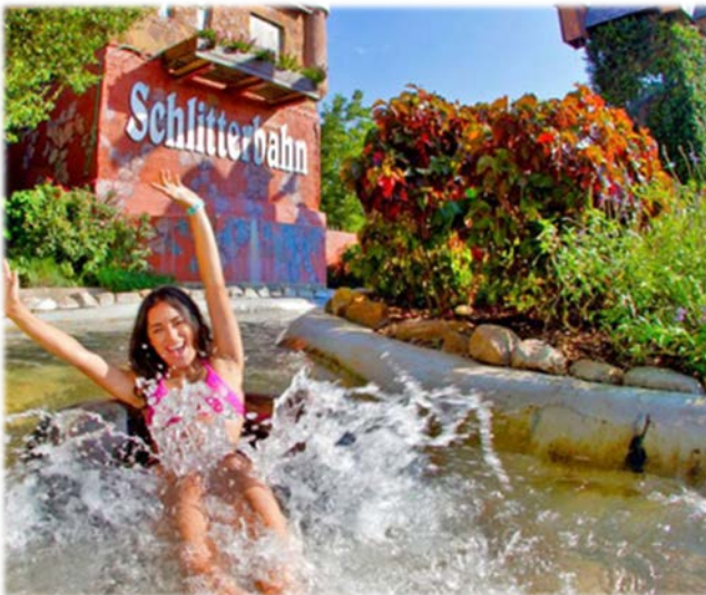
Schlitterbahn Waterpark & Resorts – Corpus Christie, Galveston, New Braunfels & South Padre Island, Texas