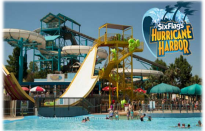
Hurricane Harbor, Arlington, Texas